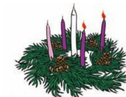
Second Sunday of Advent