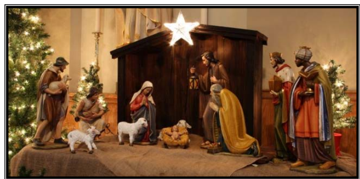
New Year's Blessings from St. Margaret's Clergy and Staff

During the government imposed lockdown, modified hours start January 5<sup>th</sup>, 2021 Tuesdays and Wednesdays 9:30 am – 11:30 am