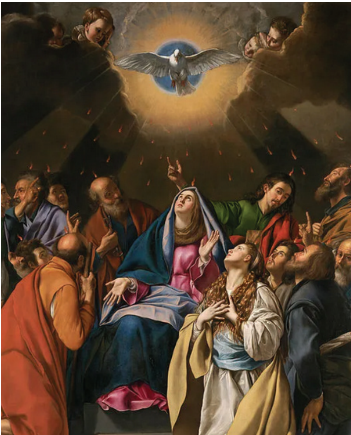
All of them were filled with the Holy Spirit and began to speak in other languages, as the Spirit gave them ability. Acts 2:4